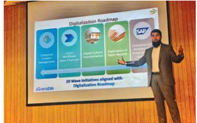
Digital Champions Session at PARCO Corporate Headquarter on March 3, 2023